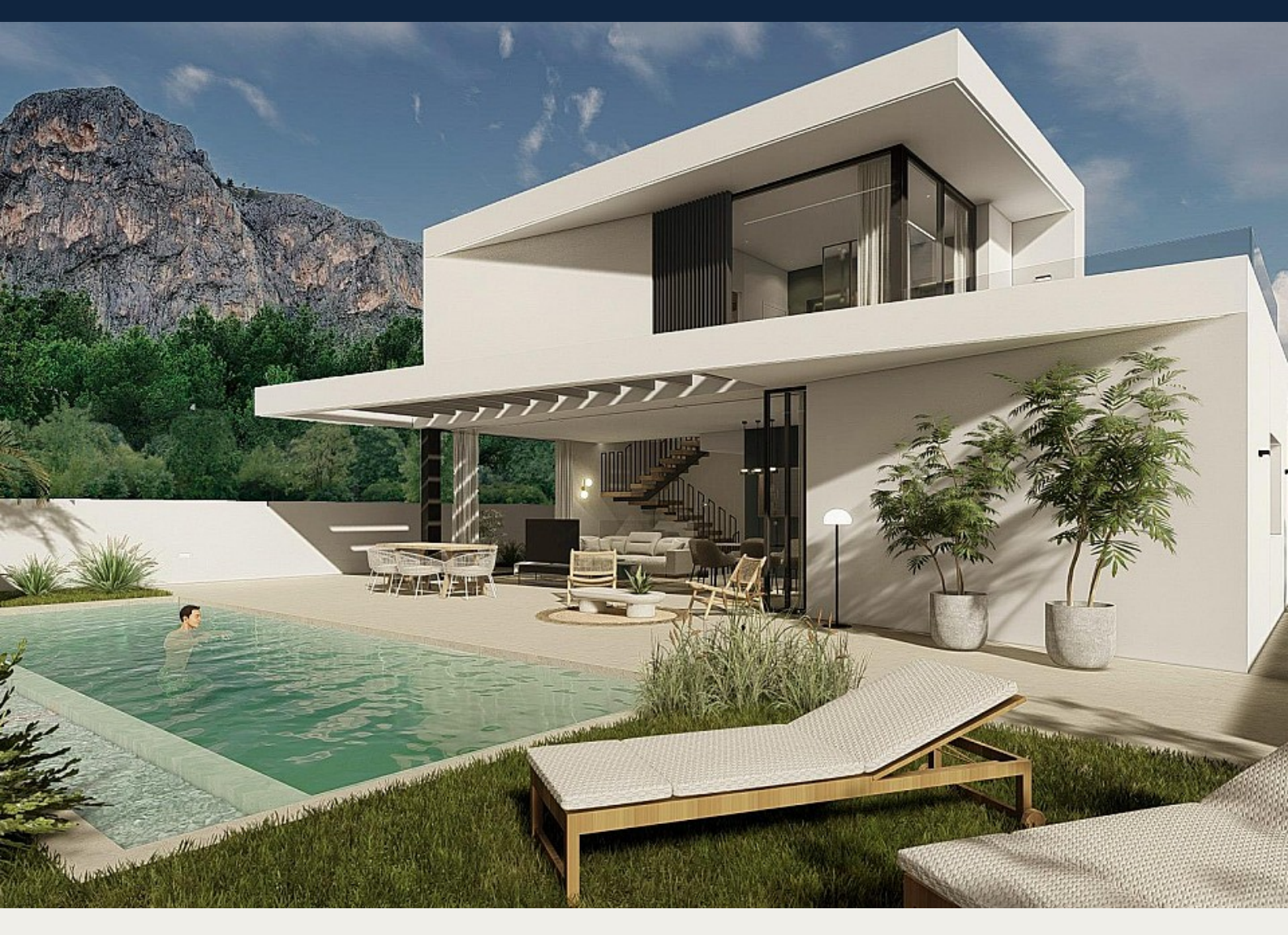
Detached Villa in Polop - New build