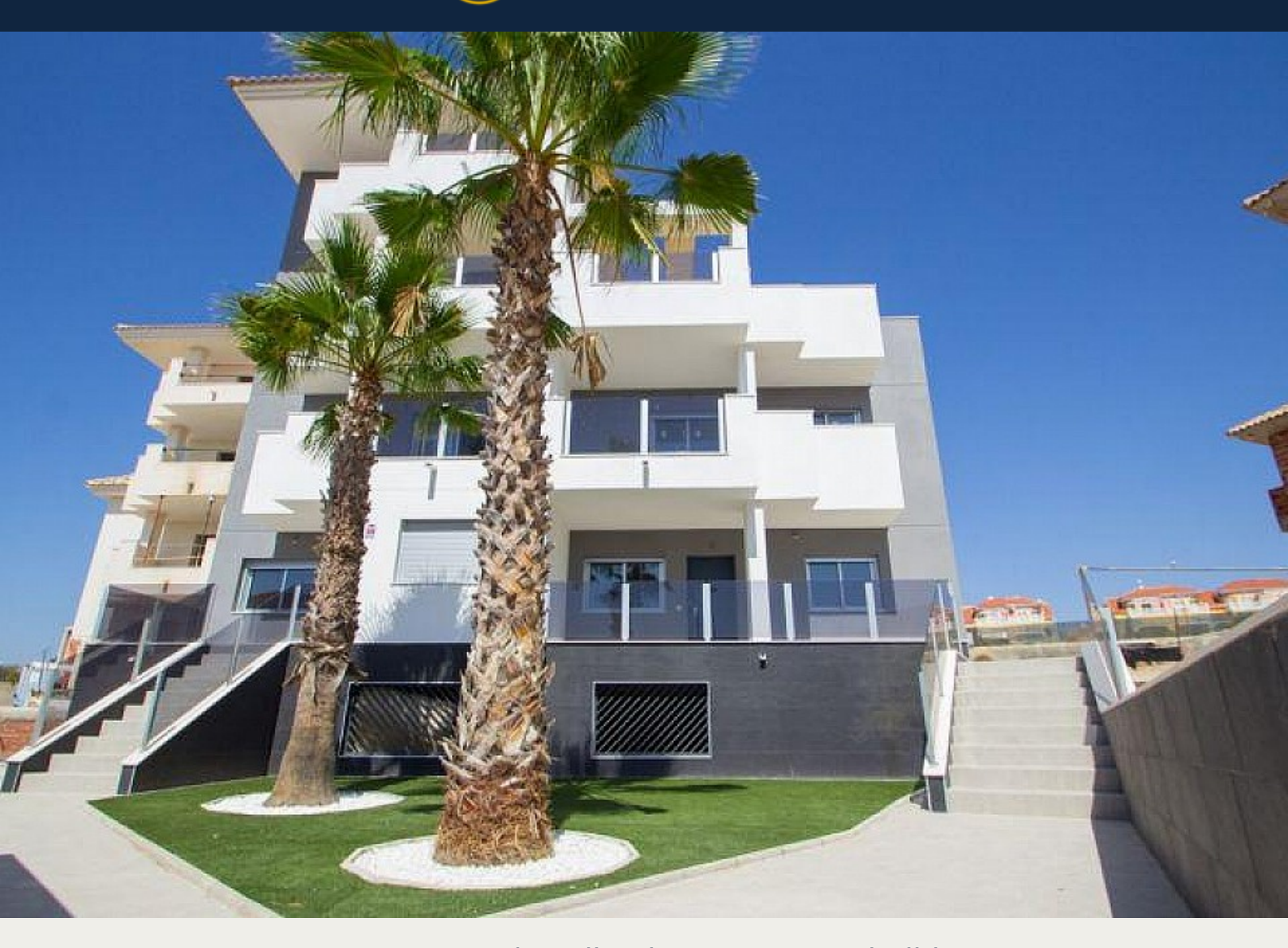
Apartment in Orihuela Costa - New build