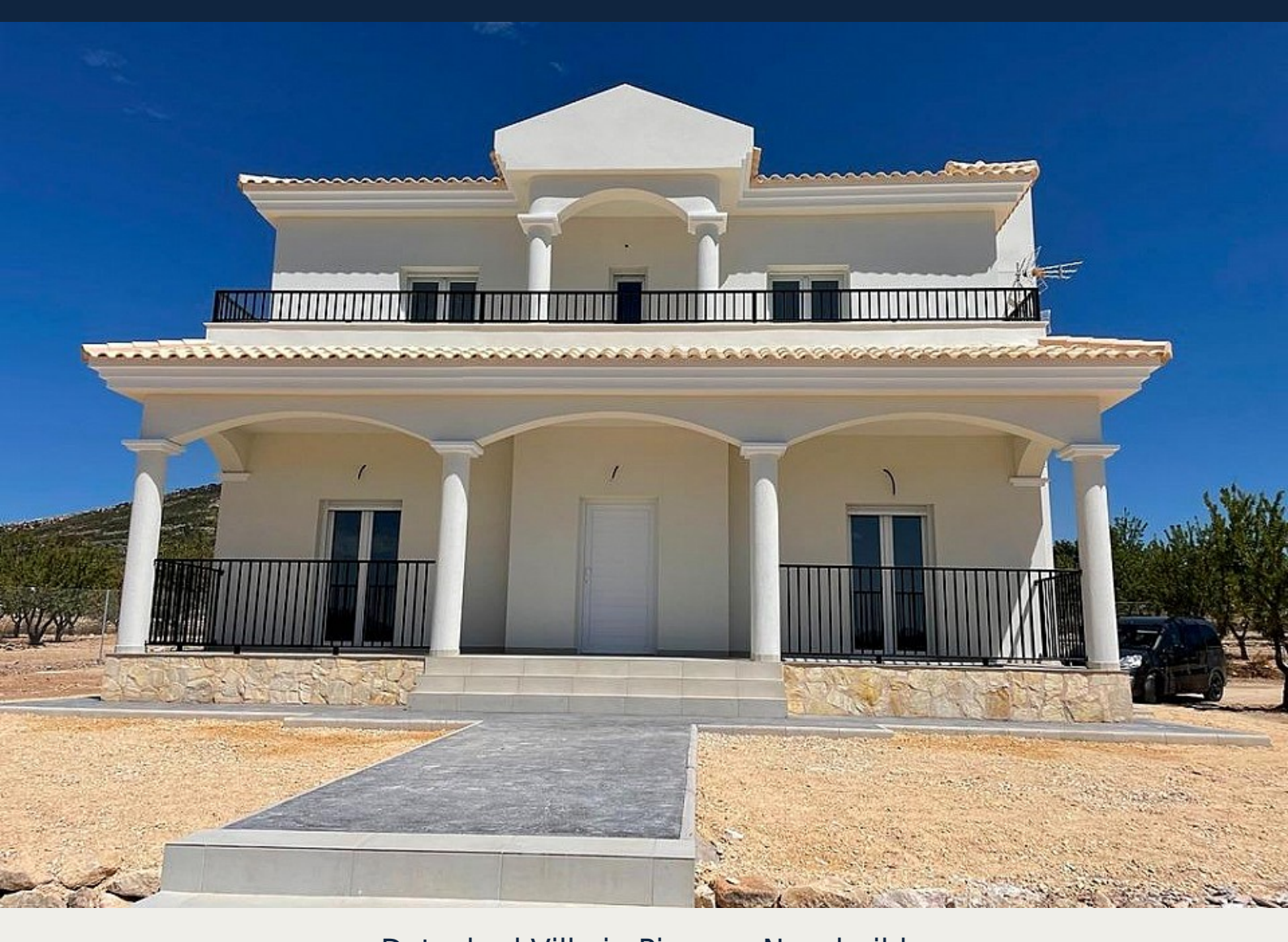
Detached Villa in Pinoso - New build