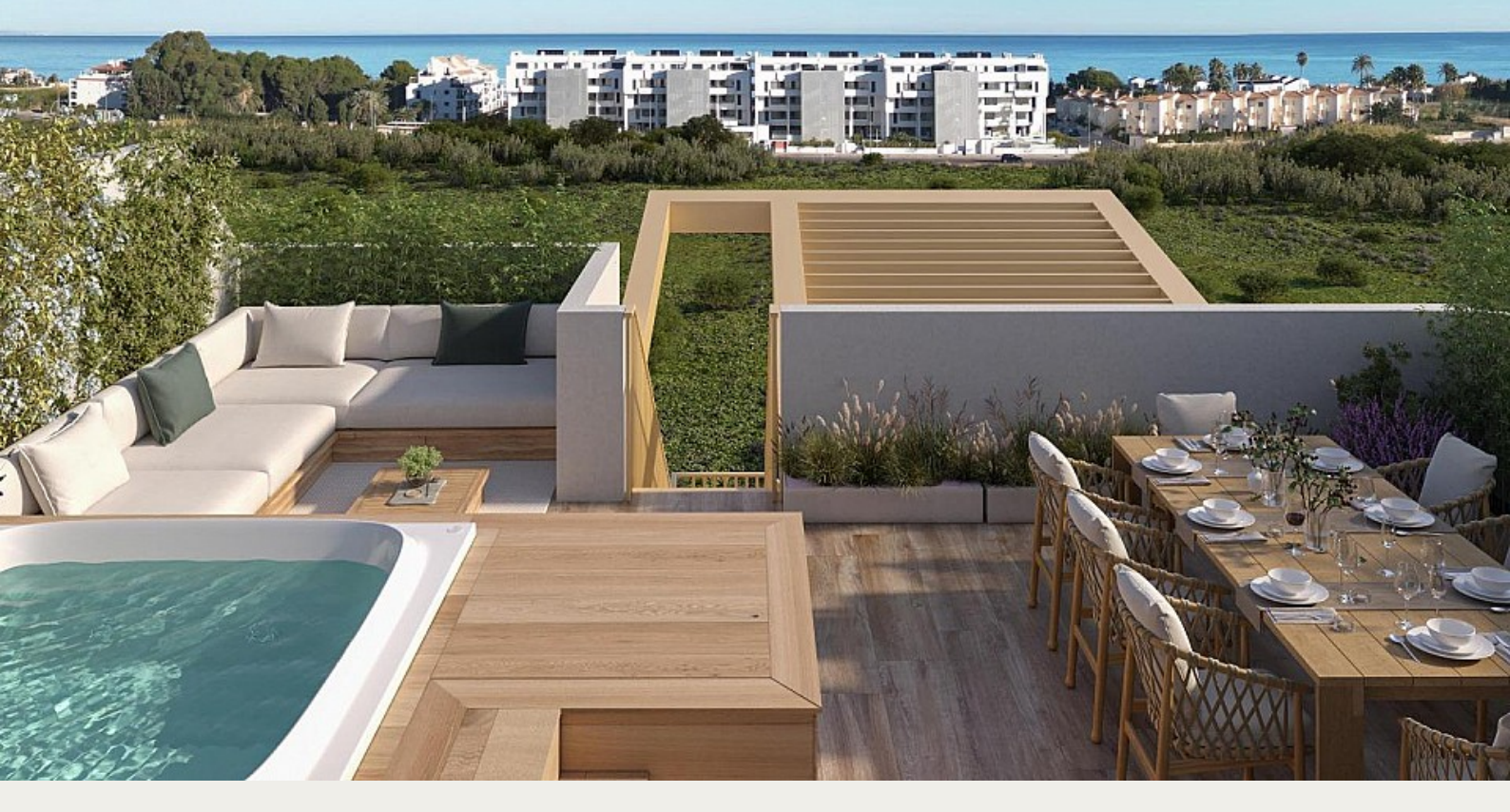
Penthouse in El Verger - New build