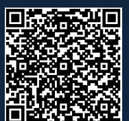
OPCIÓN 1 EMPLAZAMIENTO