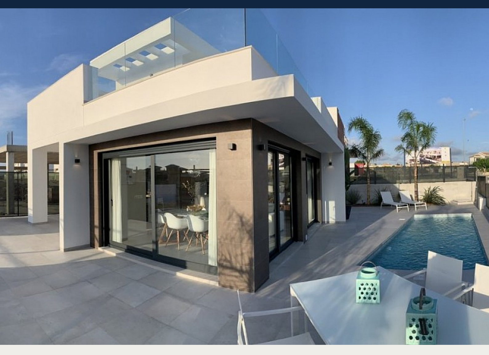
Detached Villa in Daya Nueva - New build