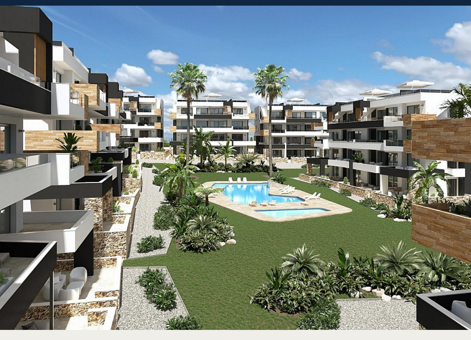
Penthouse in Orihuela Costa - New build