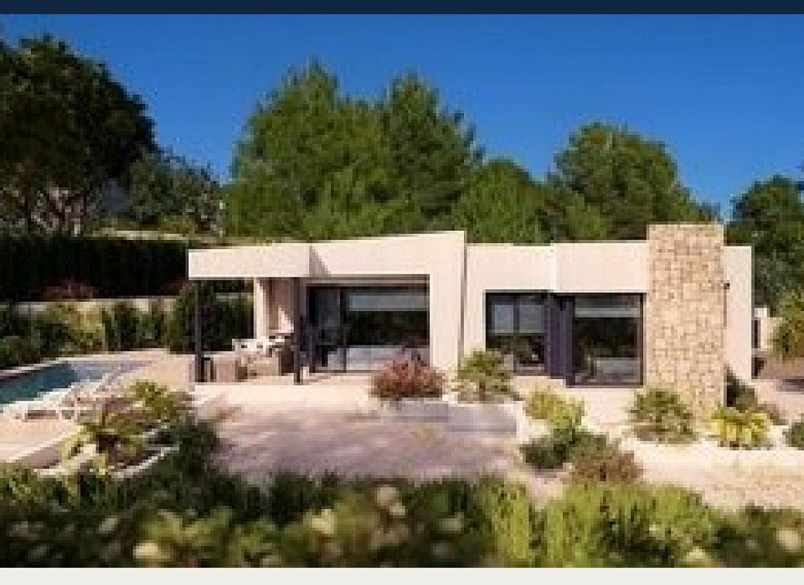
Detached Villa in Benissa - New build