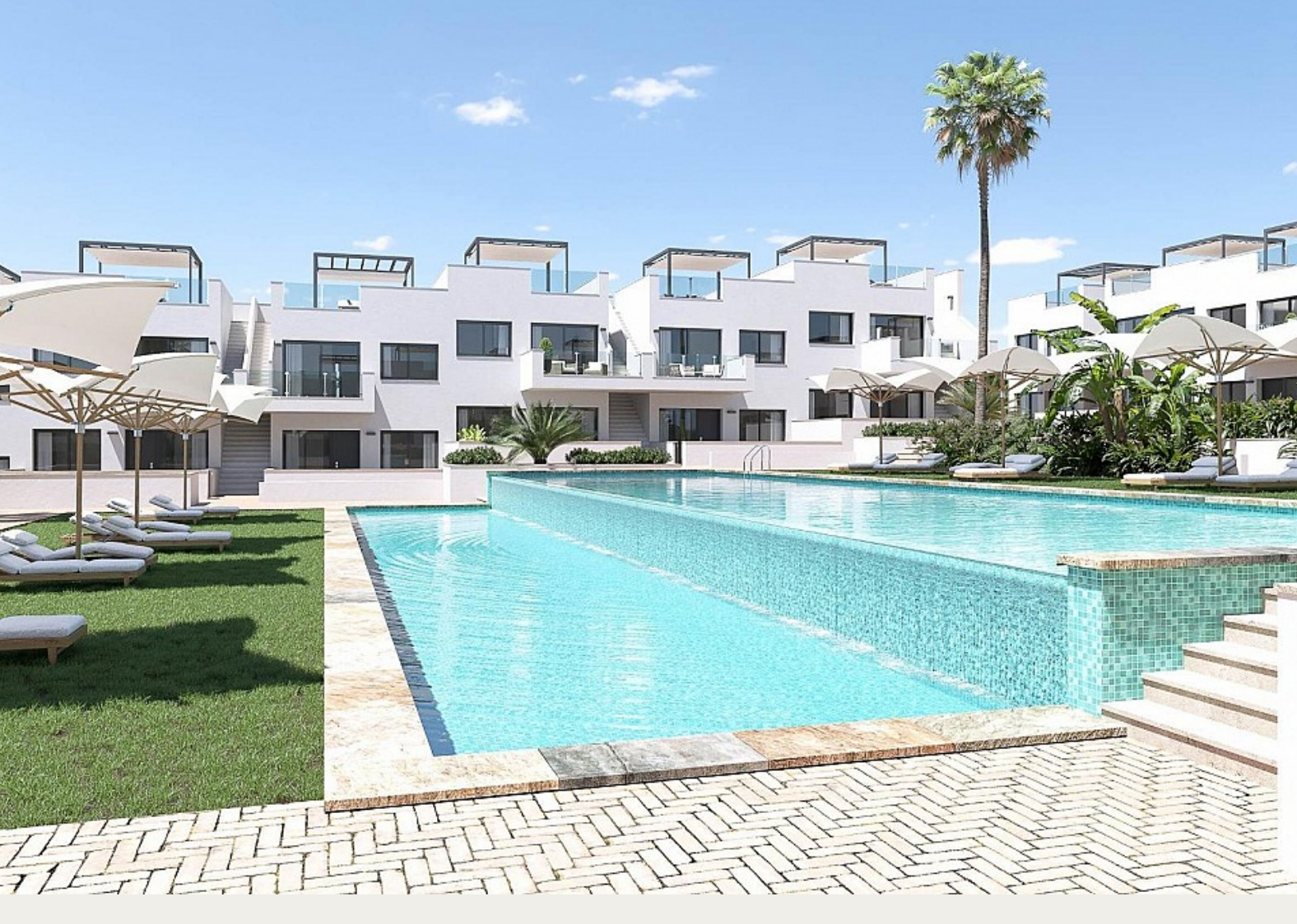
Bungalow in Torrevieja - New build