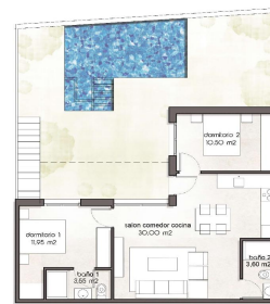
PB / GROUND FL.