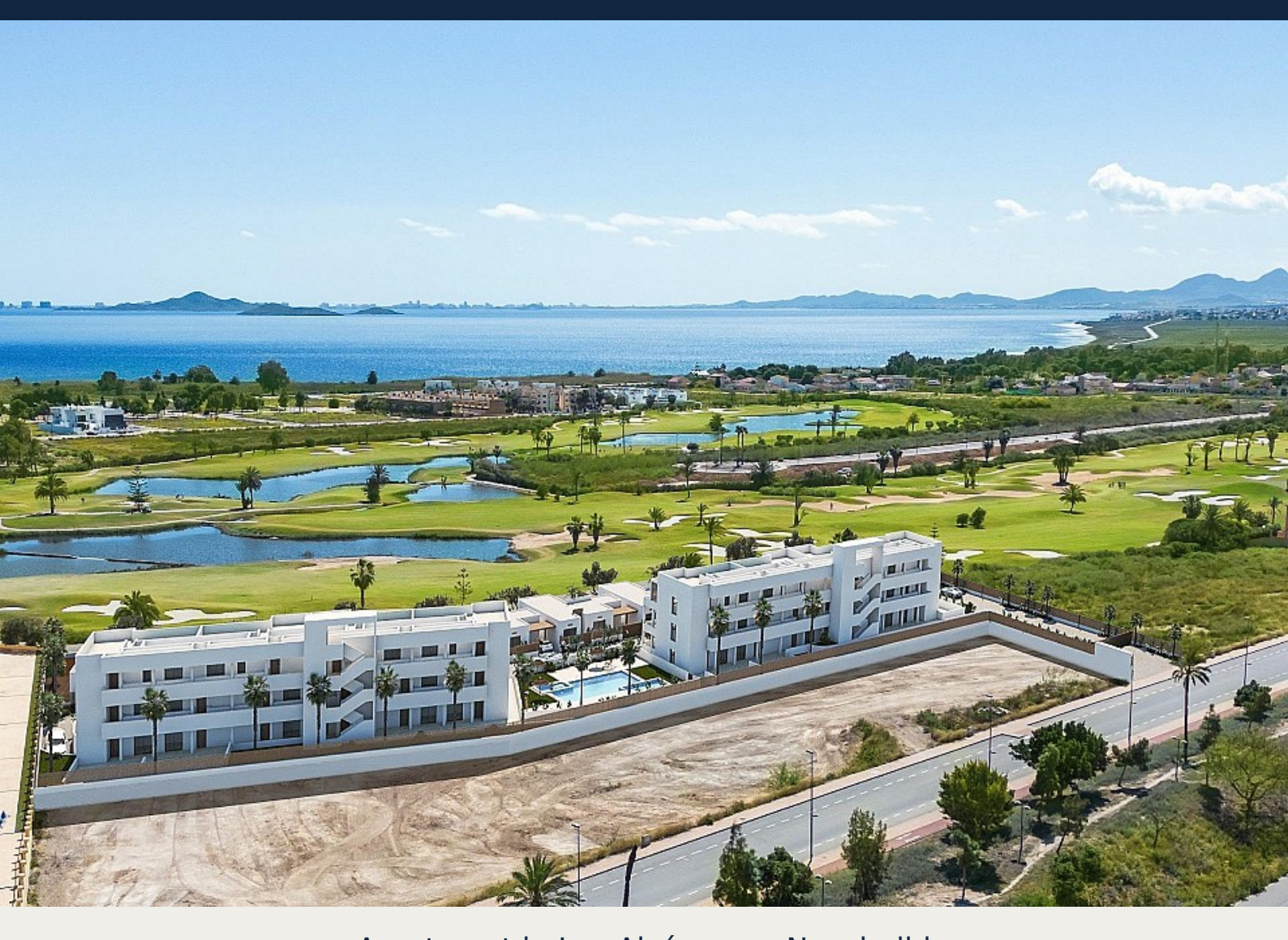
Apartment in Los Alcázares - New build