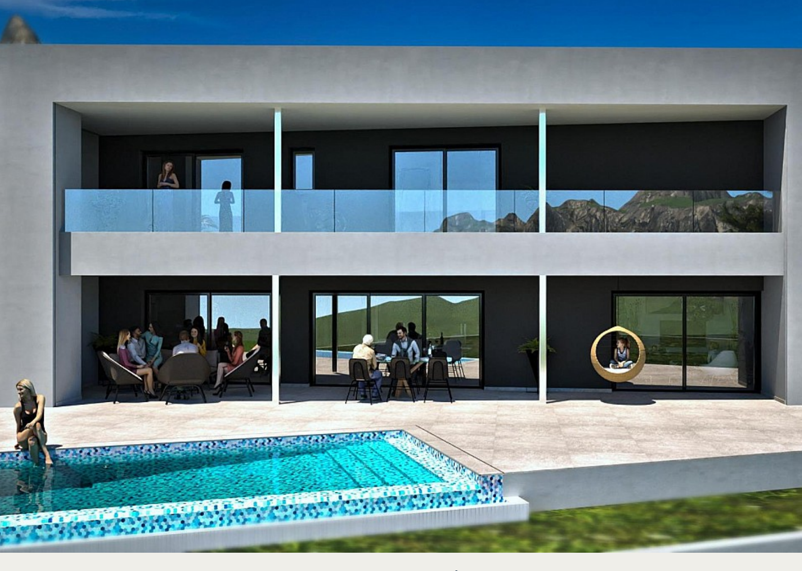
Detached Villa in La Nucía - New build