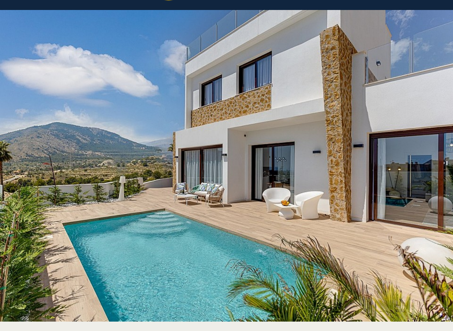
Detached Villa in Finestrat - New build