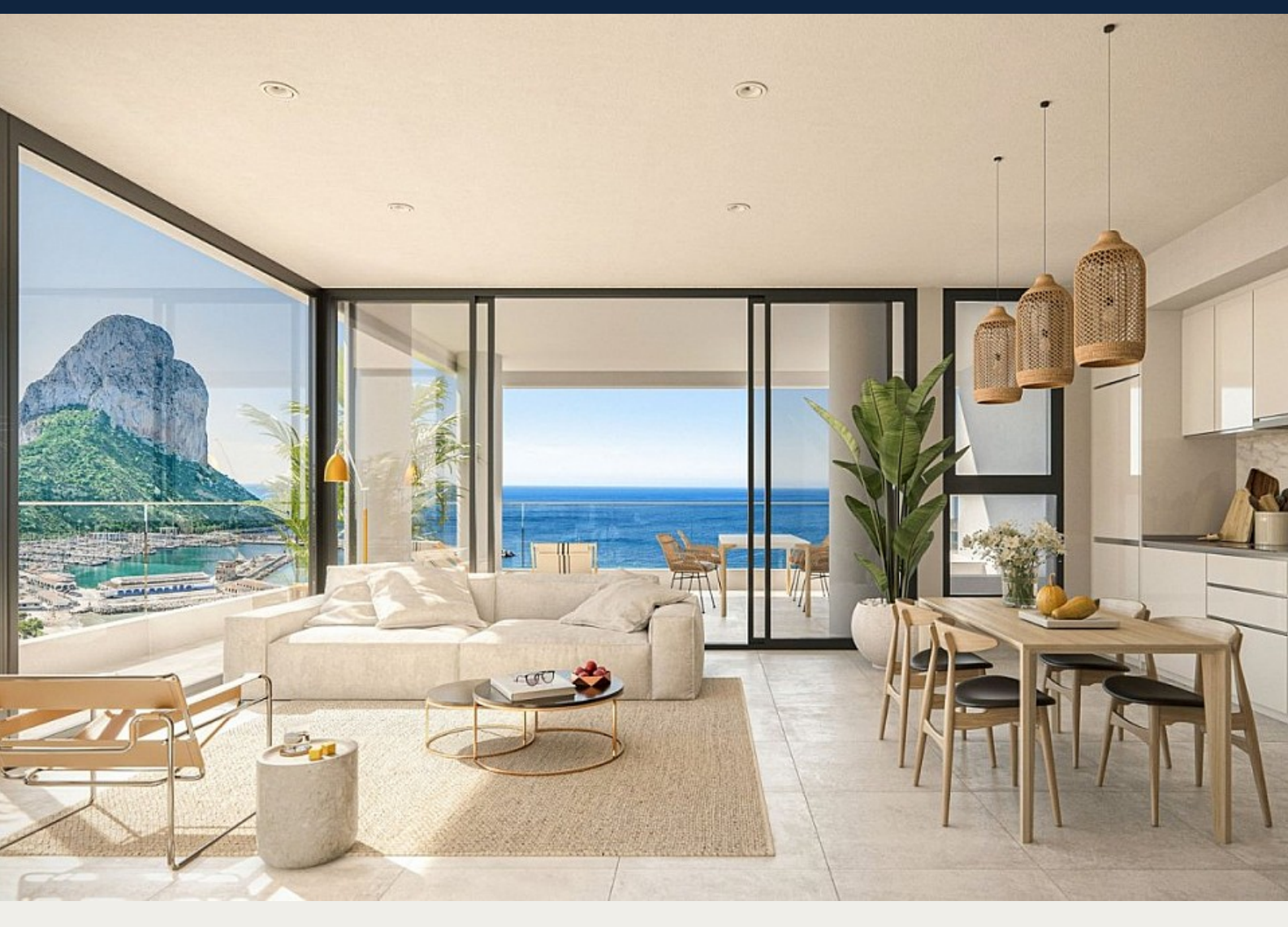
Penthouse in Calpe - New build