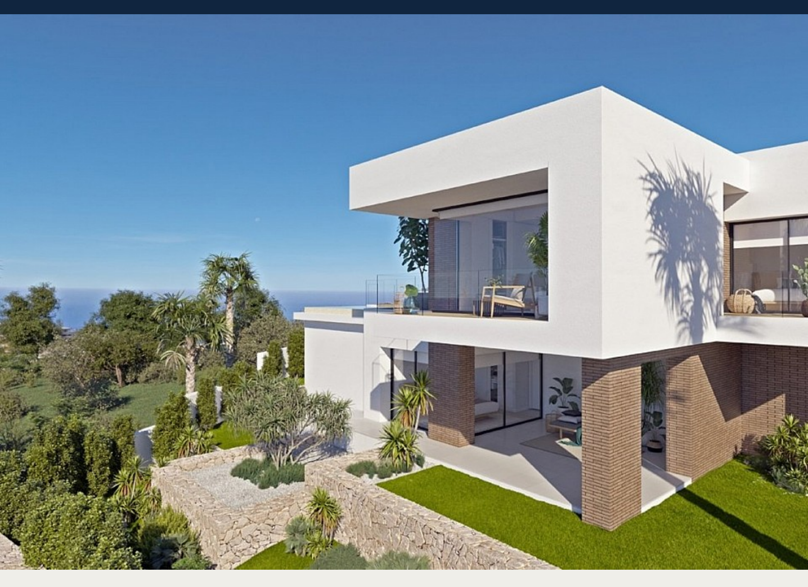
Detached Villa in Benitachell - New build