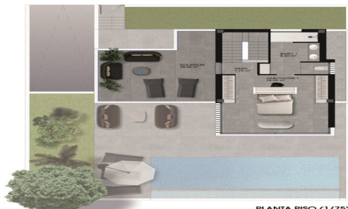
PLANTA PISO (1/75)

PARCELA 05 271.00 m 2 SUPERFICIE CONSTRUIDA SÓTANO 180.50 m 2 SUPERFICIE CONSTRUIDA PLANTA BAJA 80.90 m 2 SUPERFICIE CONSTRUIDA PLANTA PISO 45.50 m 2 SUPERFICIE CONSTRUIDA TOTAL 306.90 m 2 SUPERFICIE CONSTRUIDA TOTAL COMPUTABLE 208.80 m 2