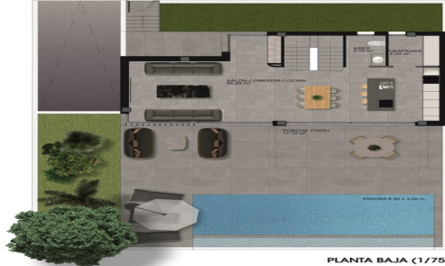
PLANTA BAJA (1/75)

PARCELA 05 271.00 m 2 SUPERFICIE CONSTRUIDA SÓTANO 180.50 m 2 SUPERFICIE CONSTRUIDA PLANTA BAJA 80.90 m 2 SUPERFICIE CONSTRUIDA PLANTA PISO 45.50 m 2 SUPERFICIE CONSTRUIDA TOTAL 306.90 m 2 SUPERFICIE CONSTRUIDA TOTAL COMPUTABLE 208.80 m 2