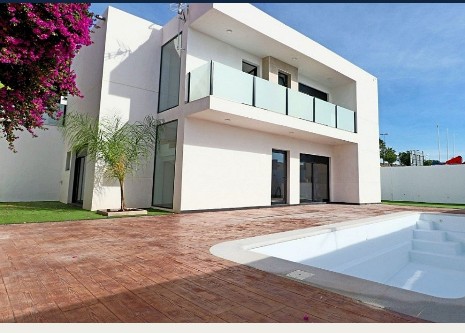
Detached Villa in Fortuna - New build