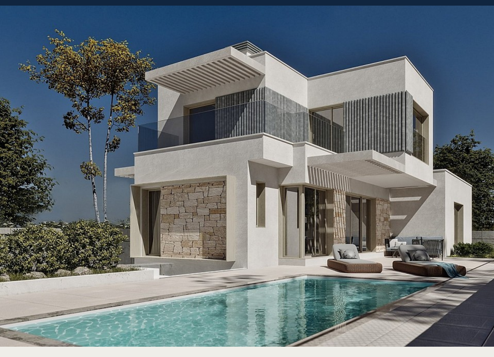
Detached Villa in Finestrat - New build