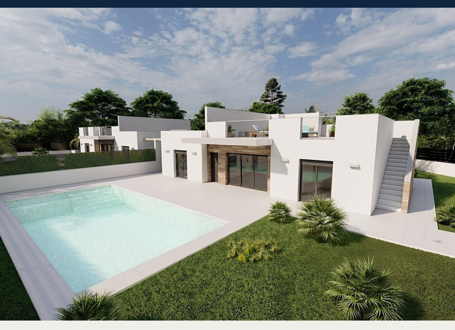
Detached Villa in Torre Pacheco - New build