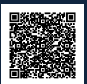
ISO A3 - ESCALA 1:75