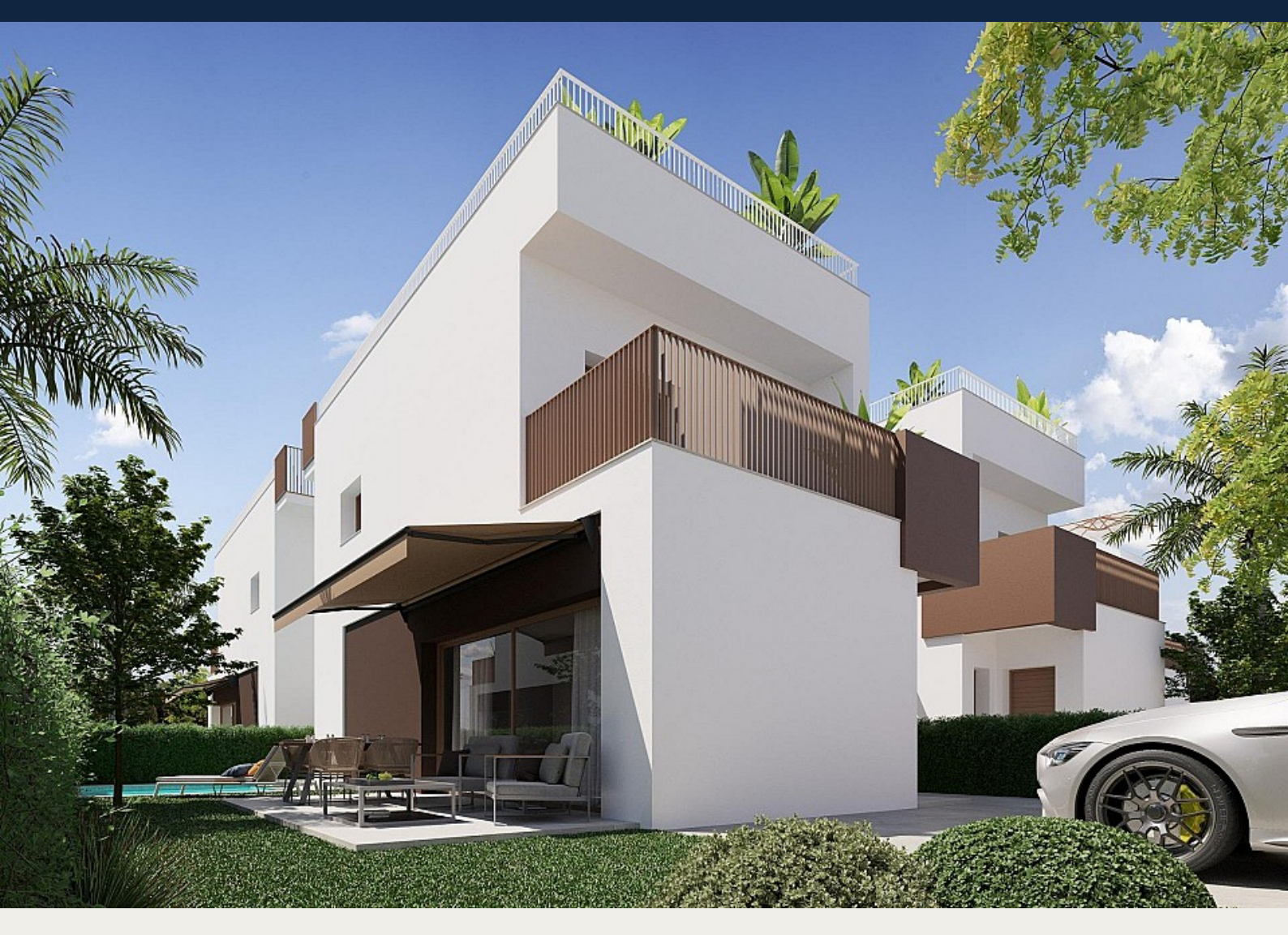
Detached Villa in La Marina - New build