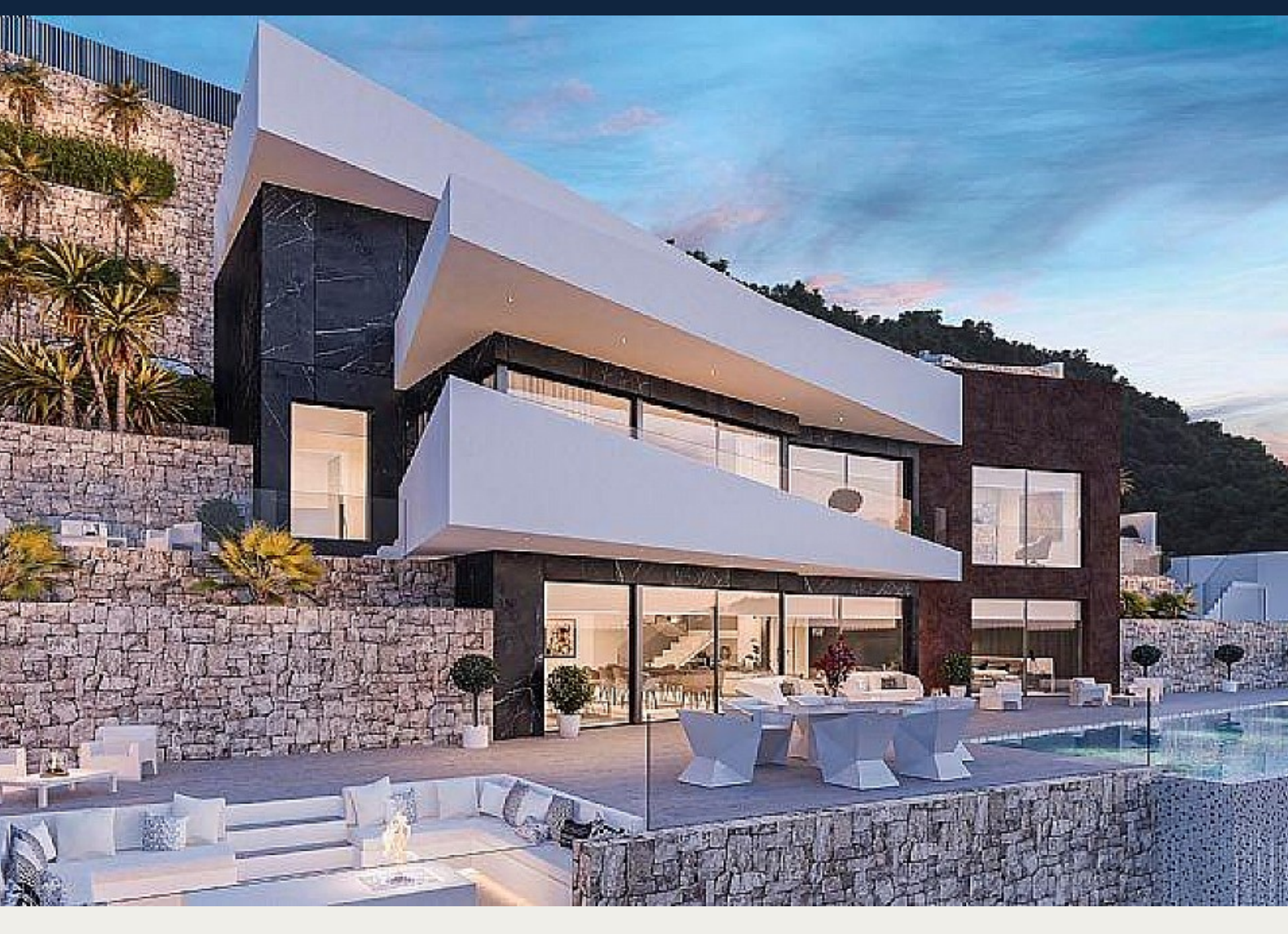
Detached Villa in Benissa - New build