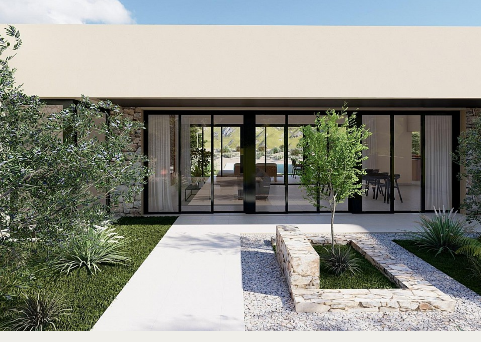
Detached Villa in Yecla - New build