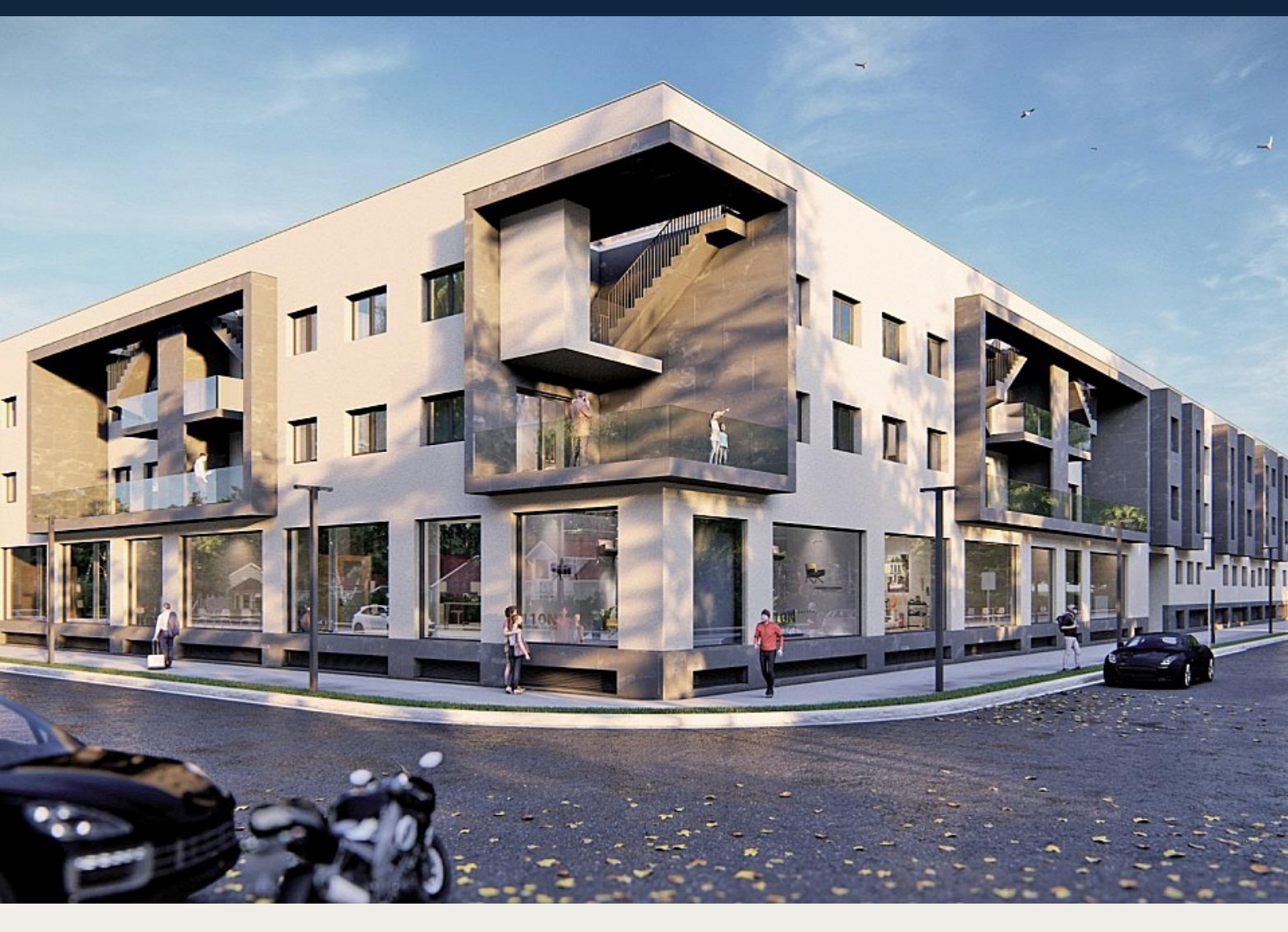
Penthouse in Torre Pacheco - New build