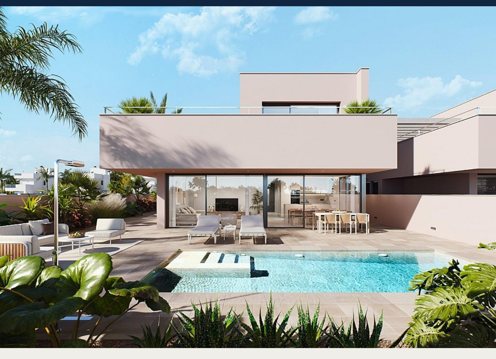
Detached Villa in Torre Pacheco - New build