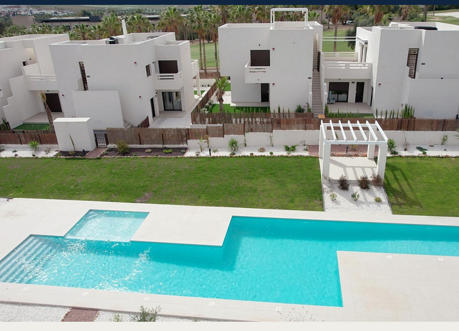
Bungalow in Algorfa - New build