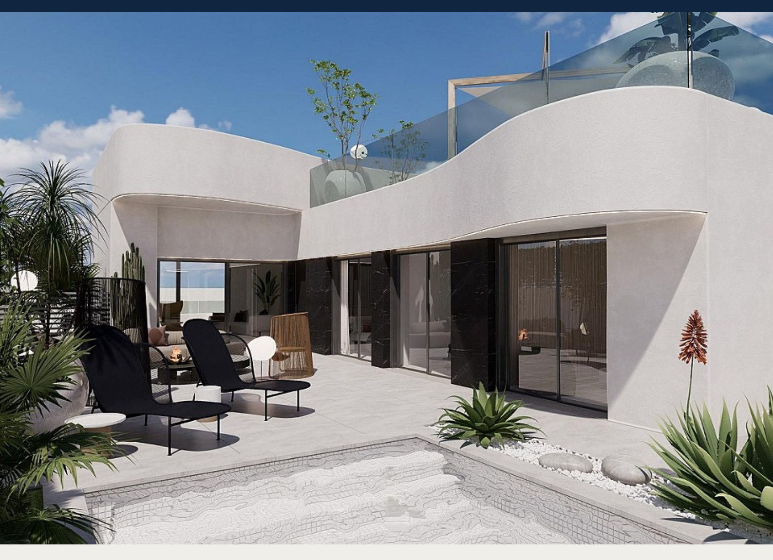
Detached Villa in Rojales - New build