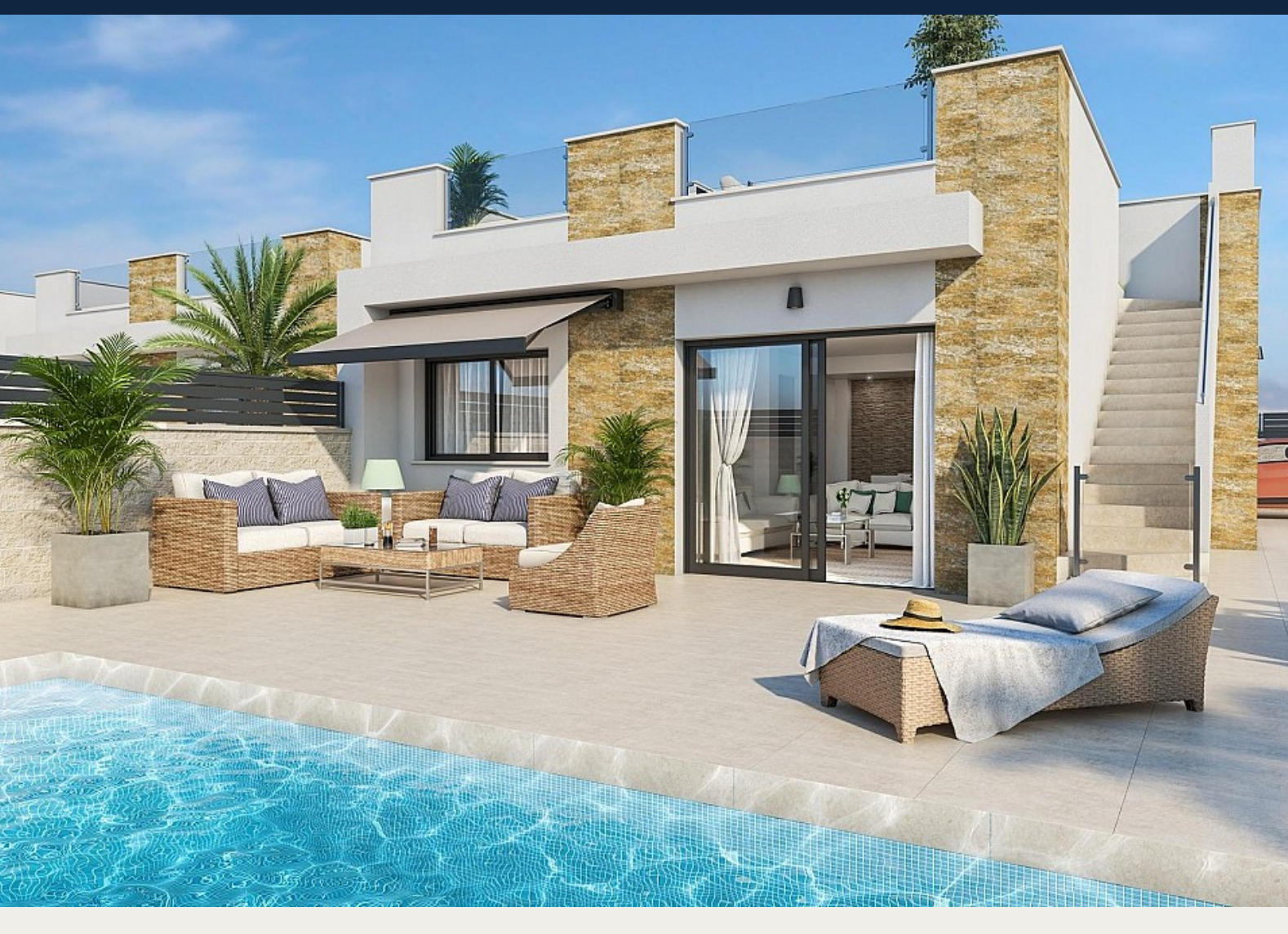
Detached Villa in Ciudad Quesada - New build