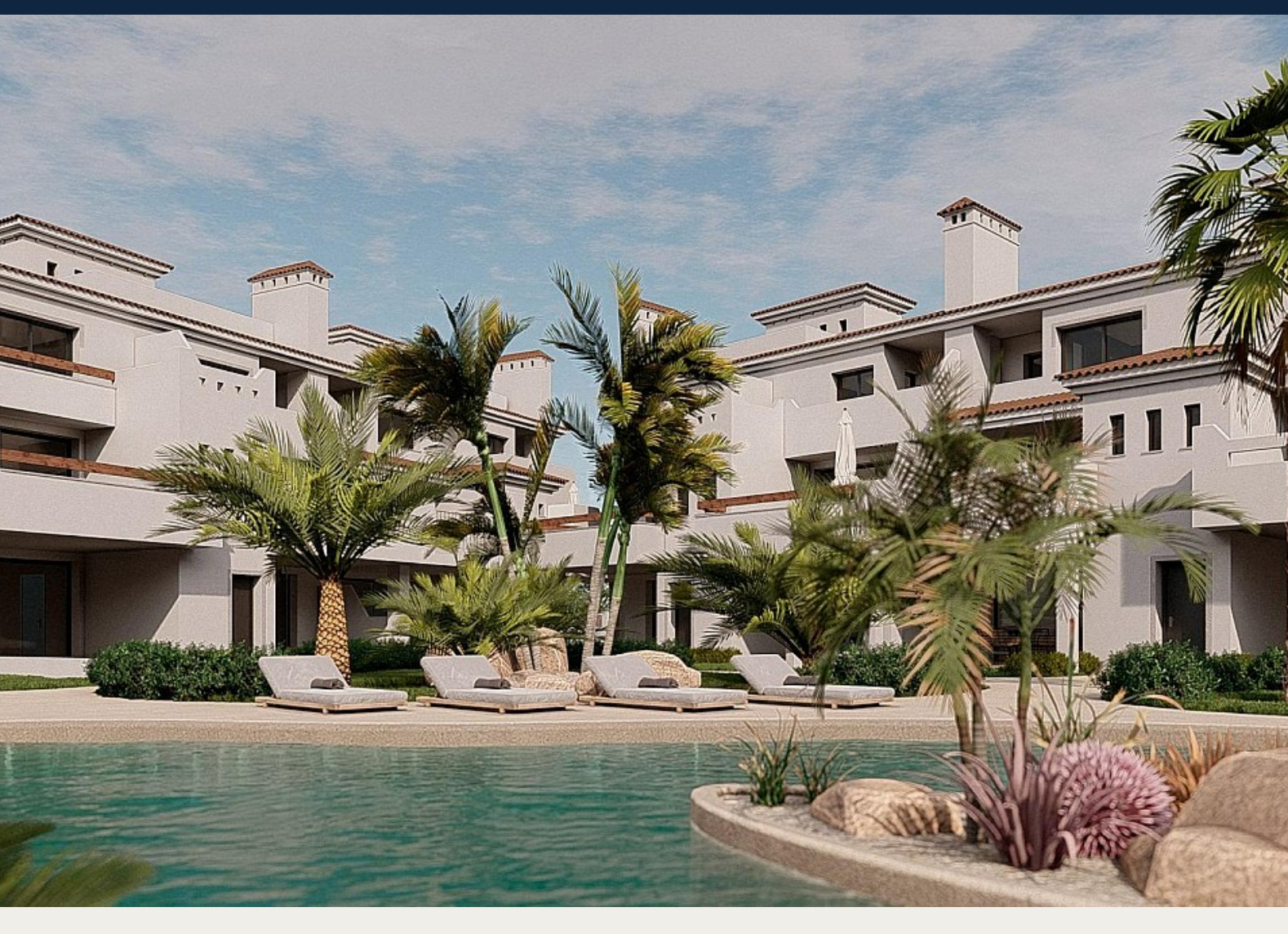
Penthouse in Los Alcázares - New build