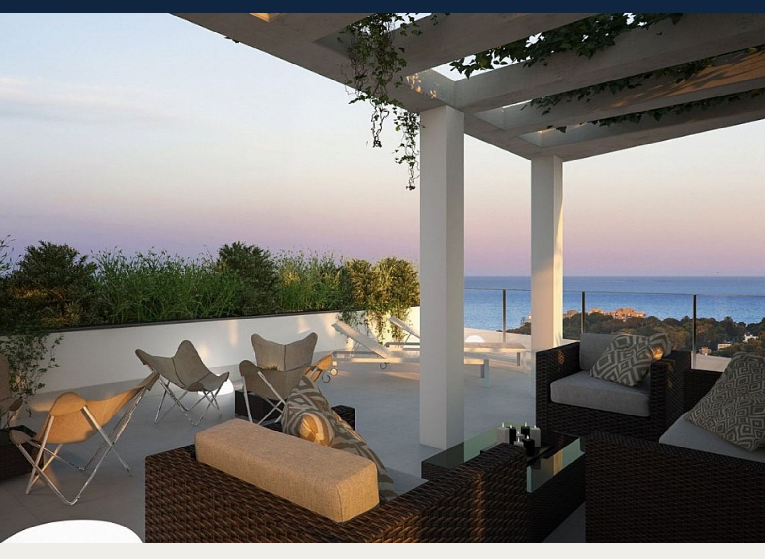
Penthouse in Orihuela Costa - New build