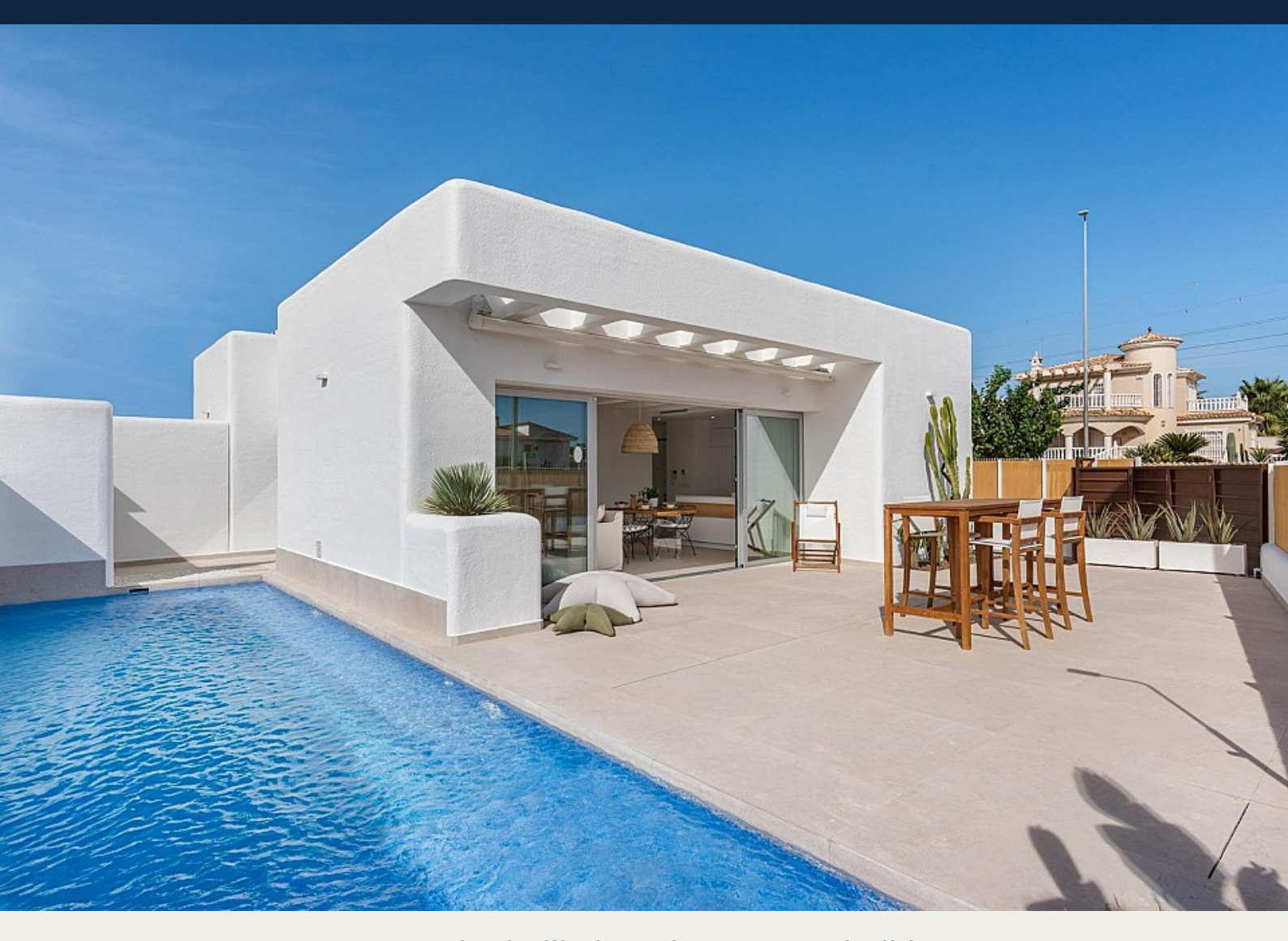
Detached Villa in Dolores - New build