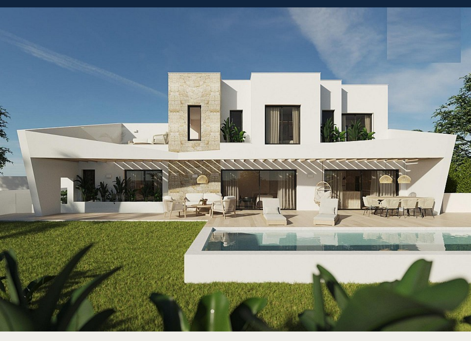
Detached Villa in Polop - New build