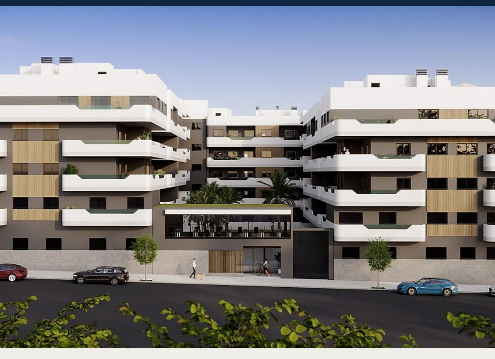
Penthouse in Santa Pola - New build