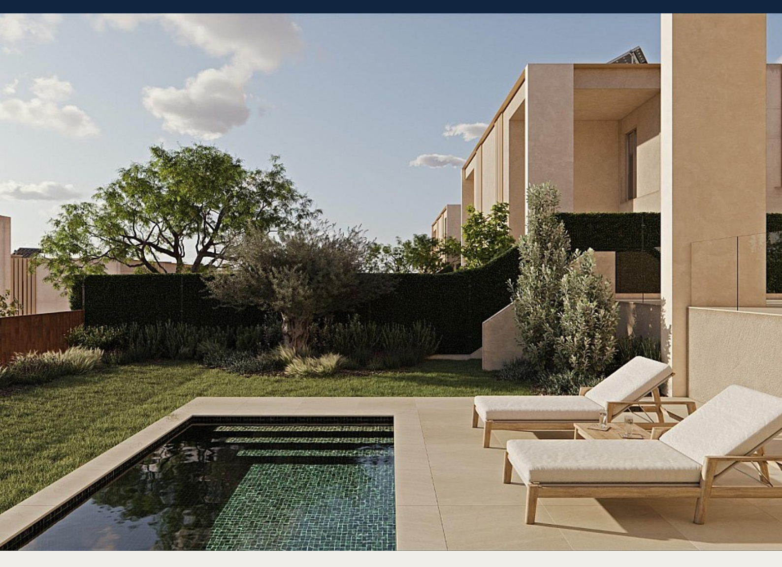
Detached Villa in Godella - New build