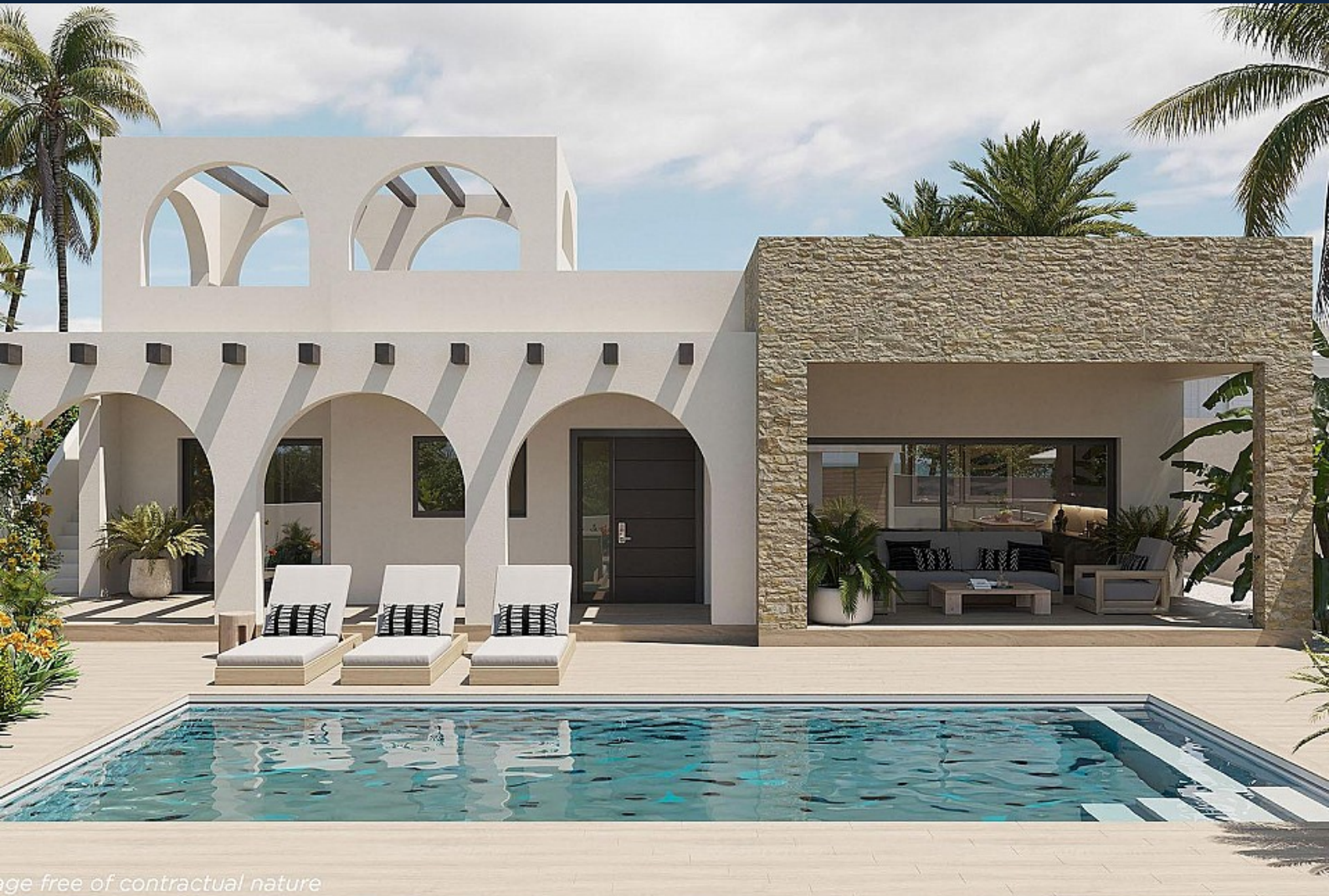
Image free of contractual nature