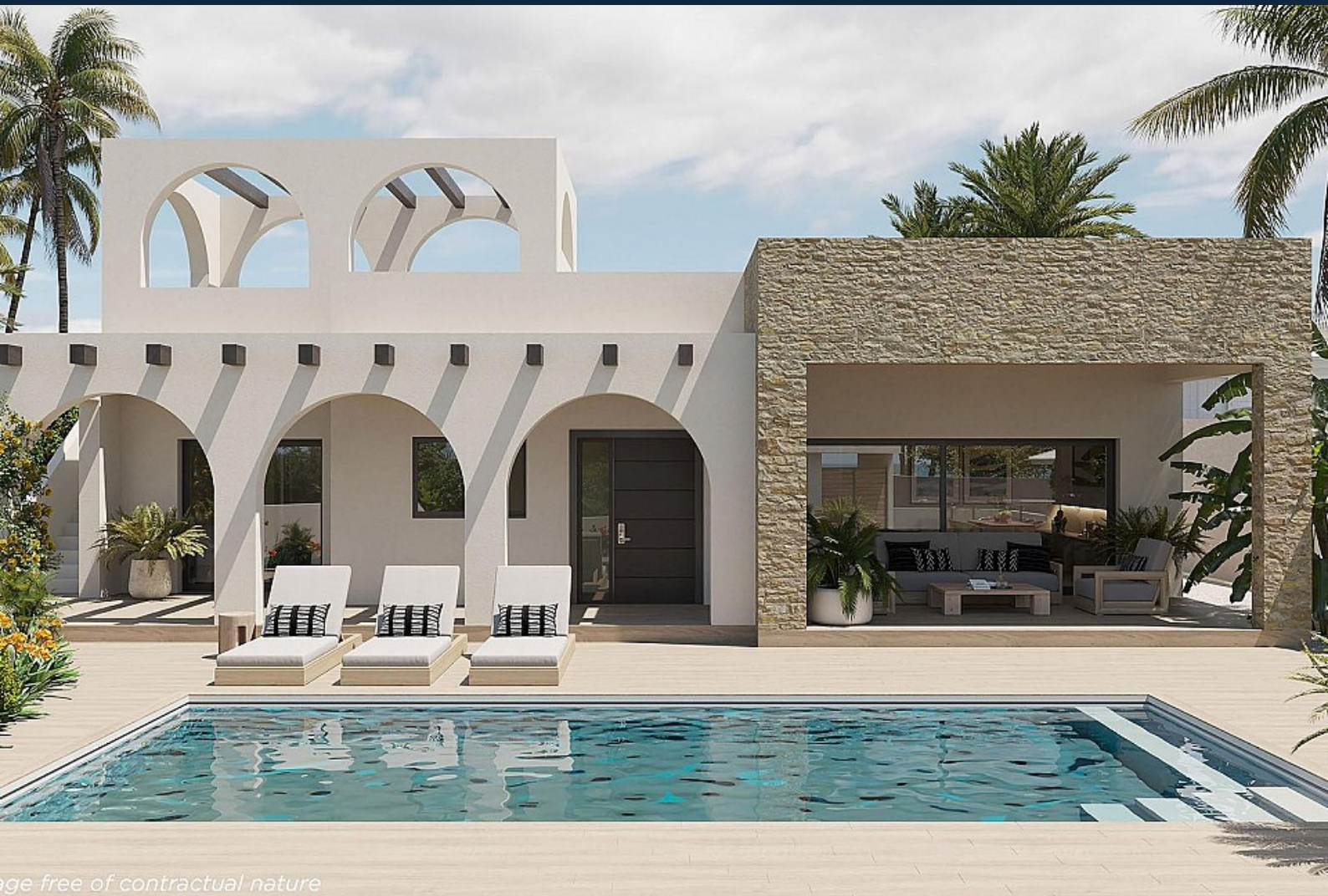
Image free of contractual nature