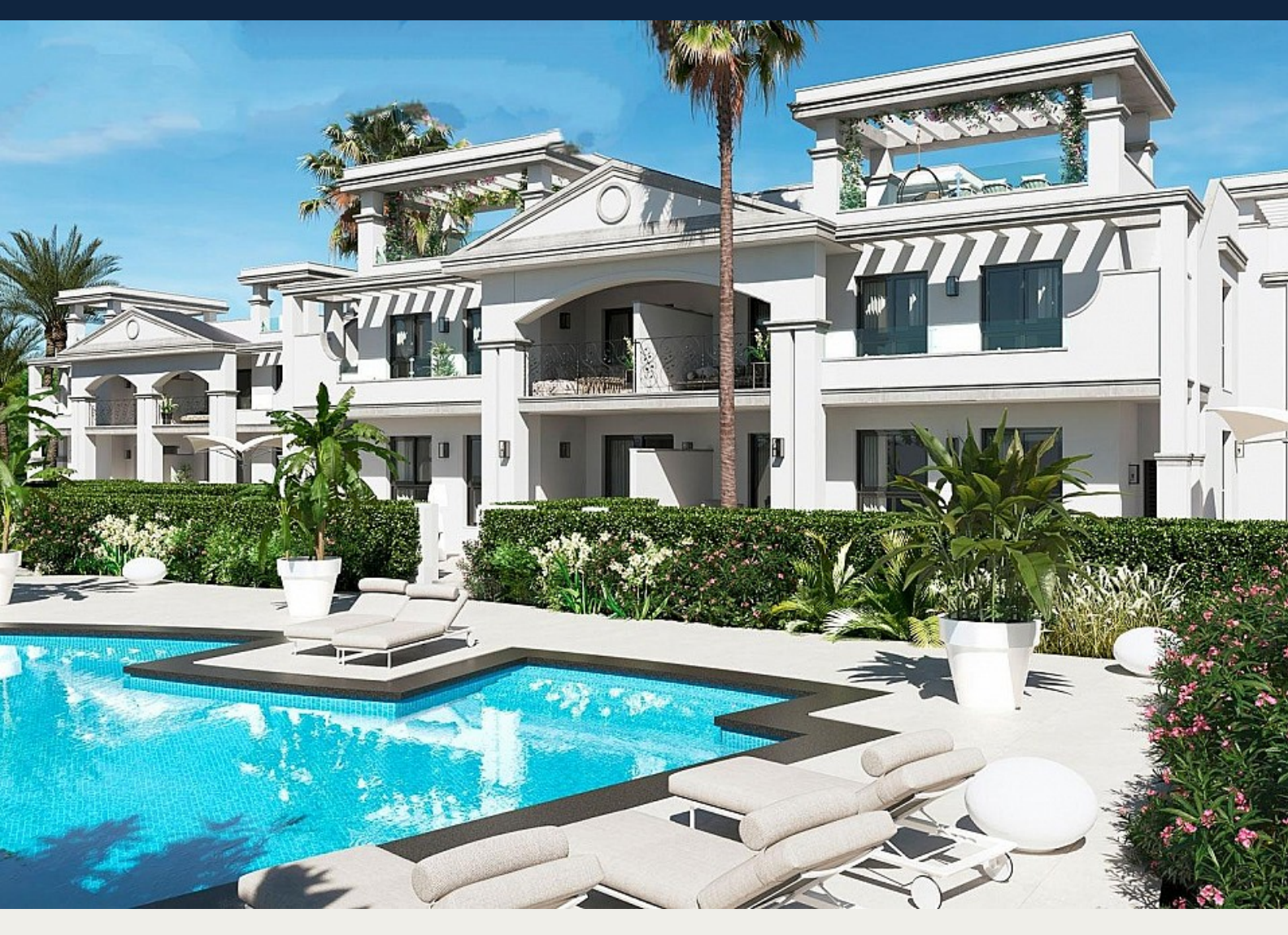
Bungalow in Rojales - New build