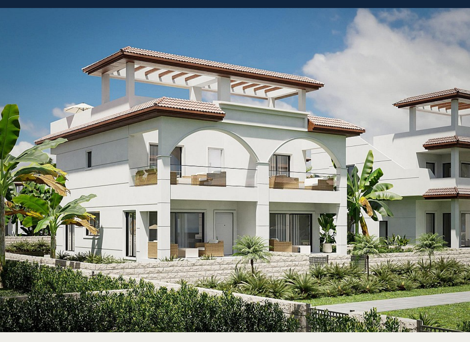
Detached Villa in Rojales - New build