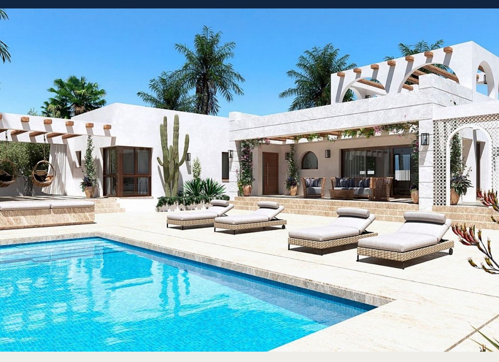
Detached Villa in Rojales - New build