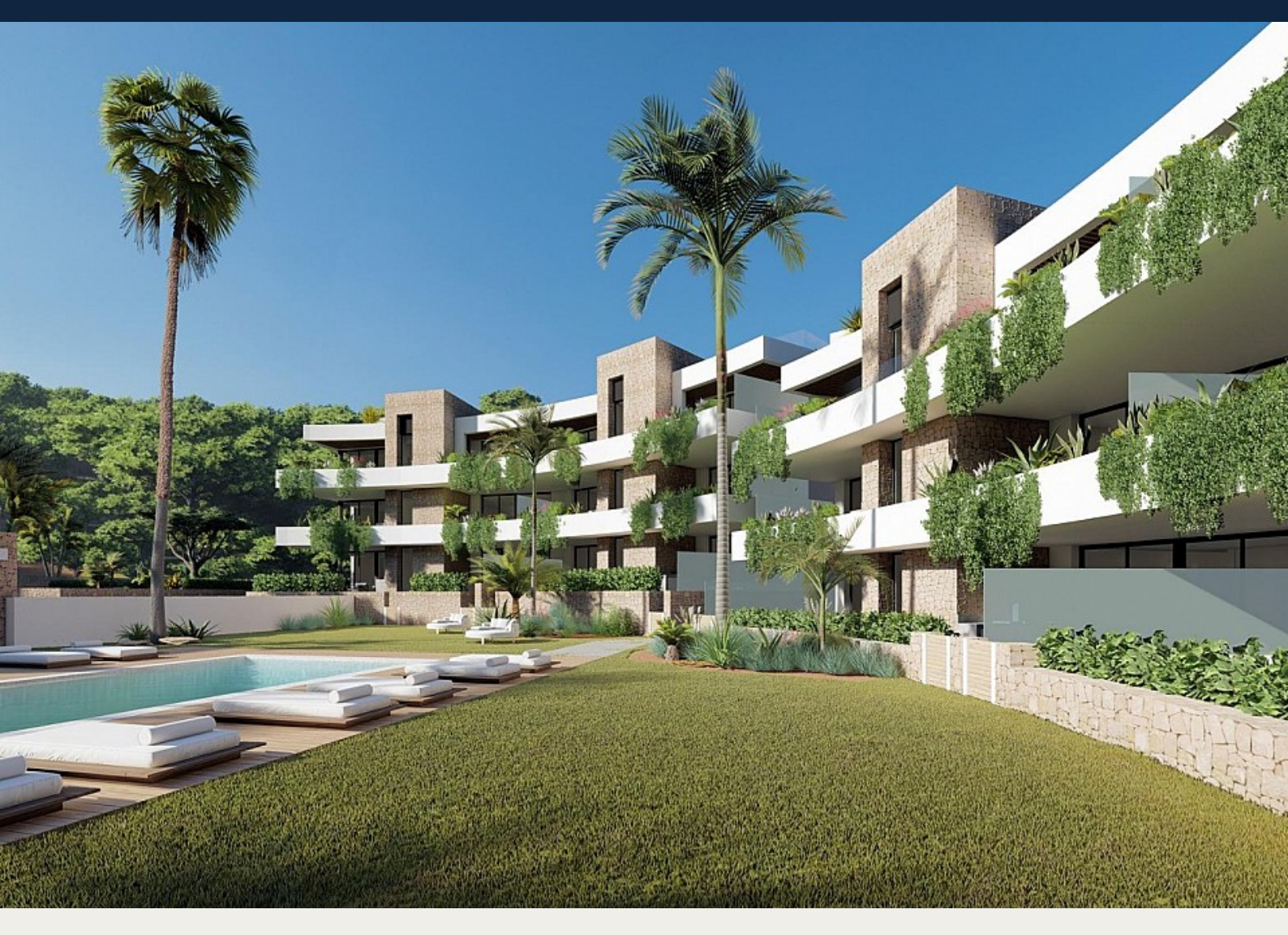
Apartment in La Manga Club - New build