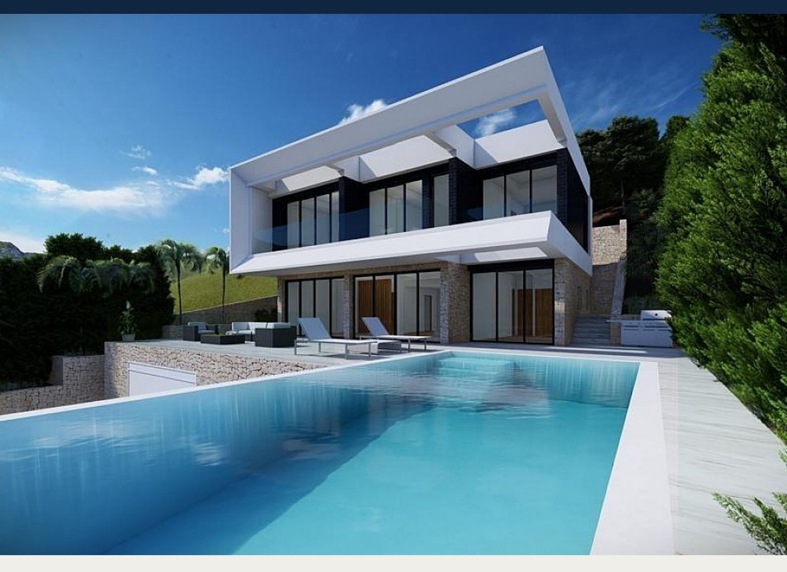
Detached Villa in Altea - New build