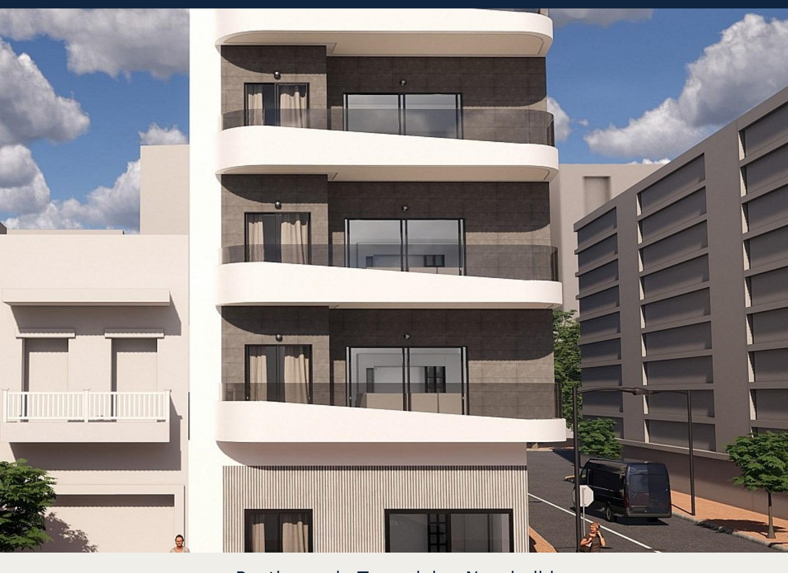
Penthouse in Torrevieja - New build