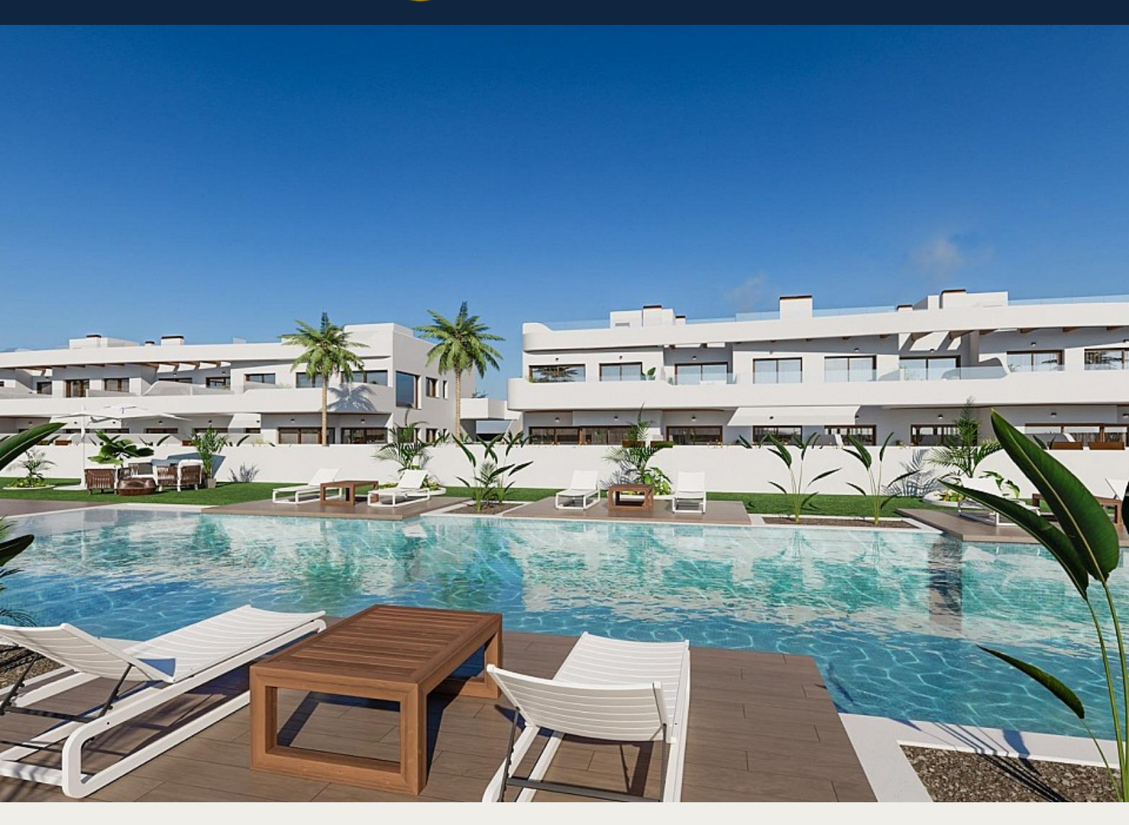
Apartment in Los Alcázares - New build