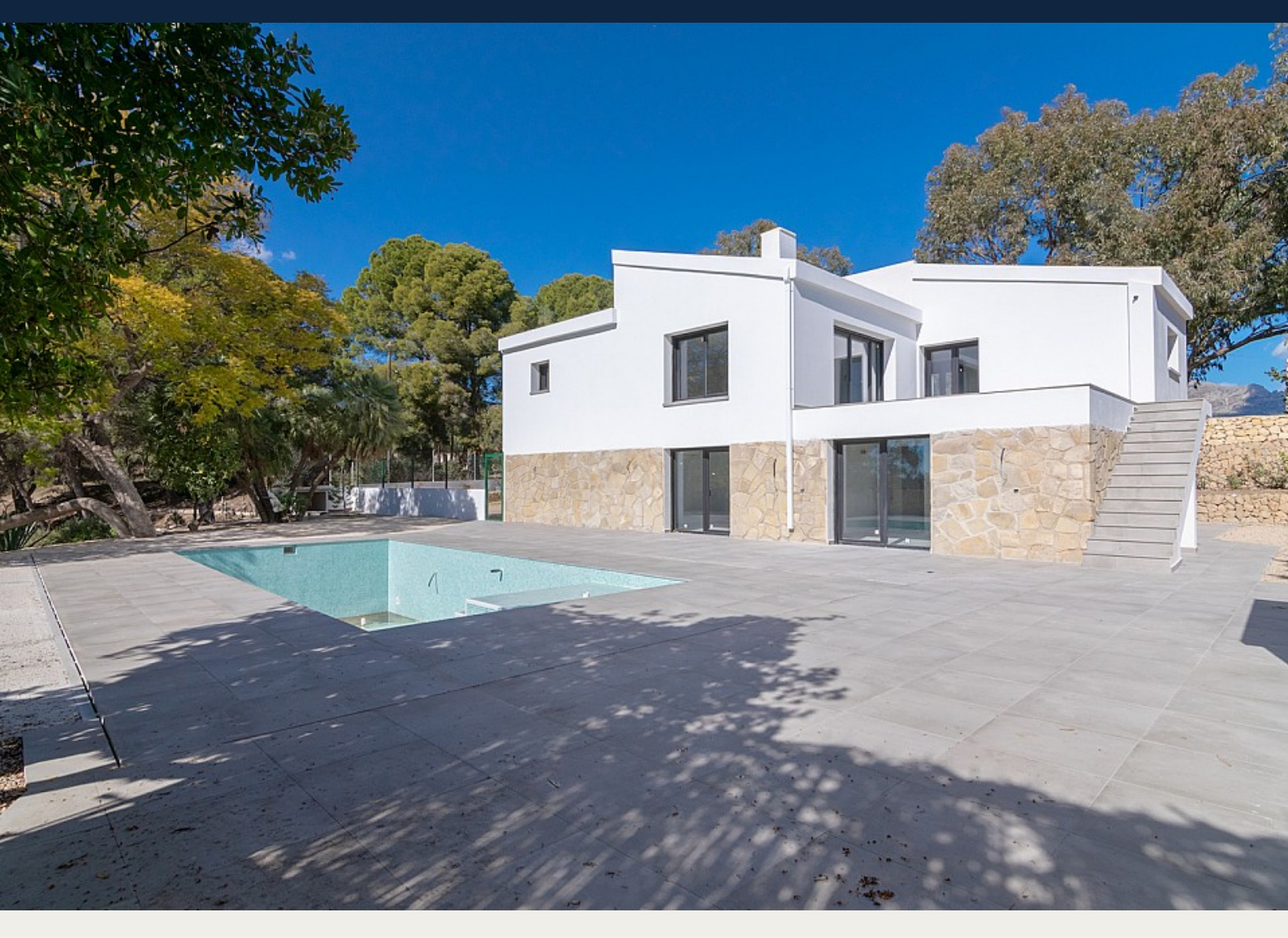
Detached Villa in Altea - Resale