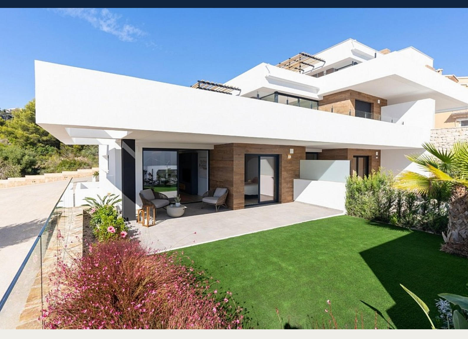
Apartment in Benitachell - New build