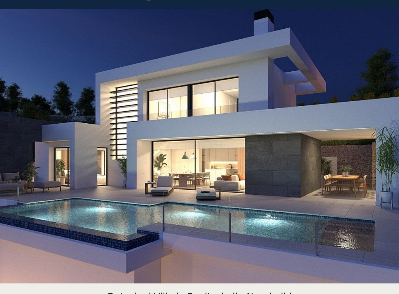
Detached Villa in Benitachell - New build