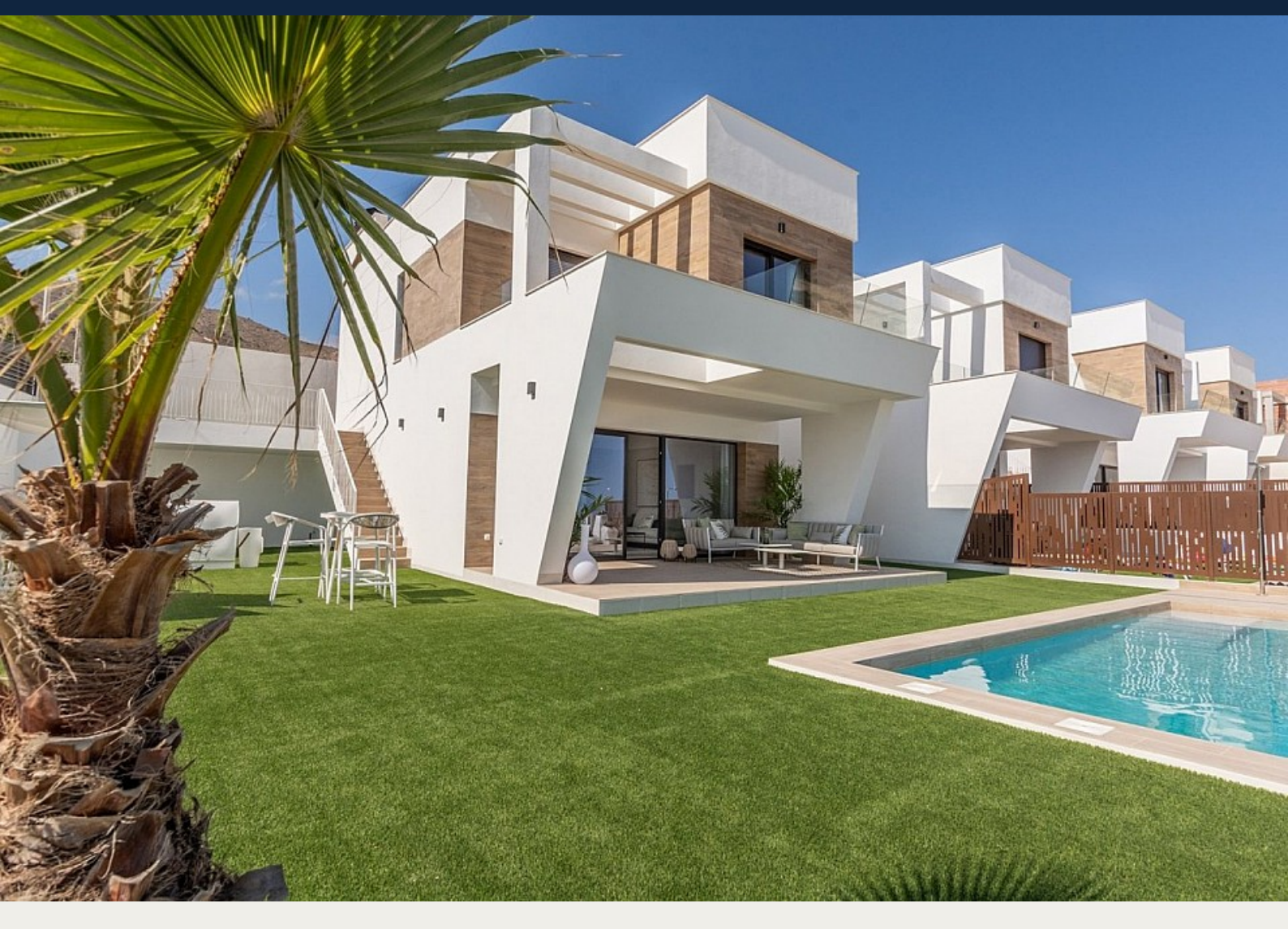
Detached Villa in Finestrat - New build