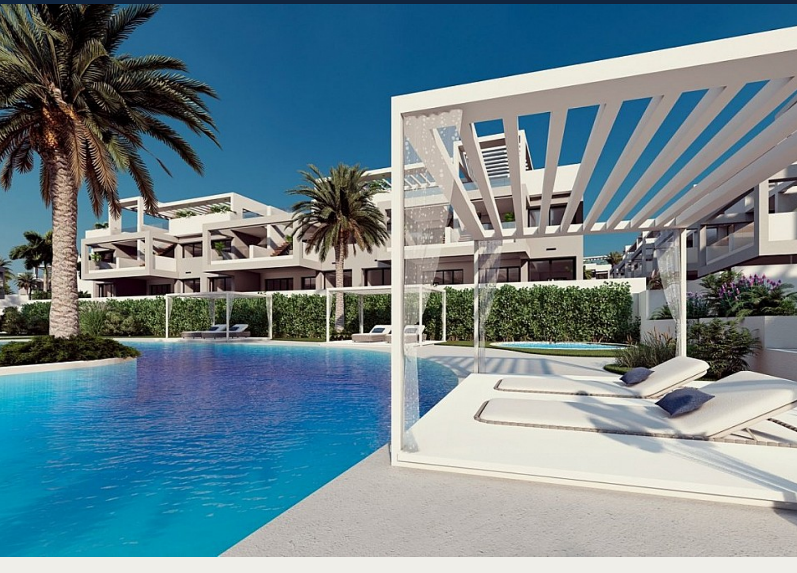
Bungalow in Torrevieja - New build