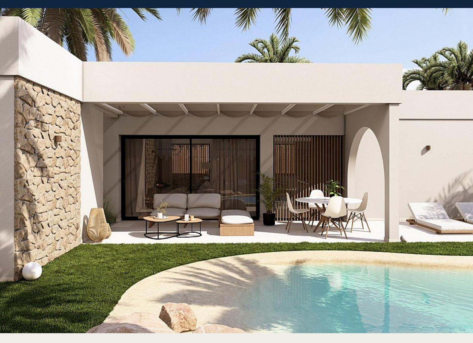
Detached Villa in Banos y Mendigo - New build