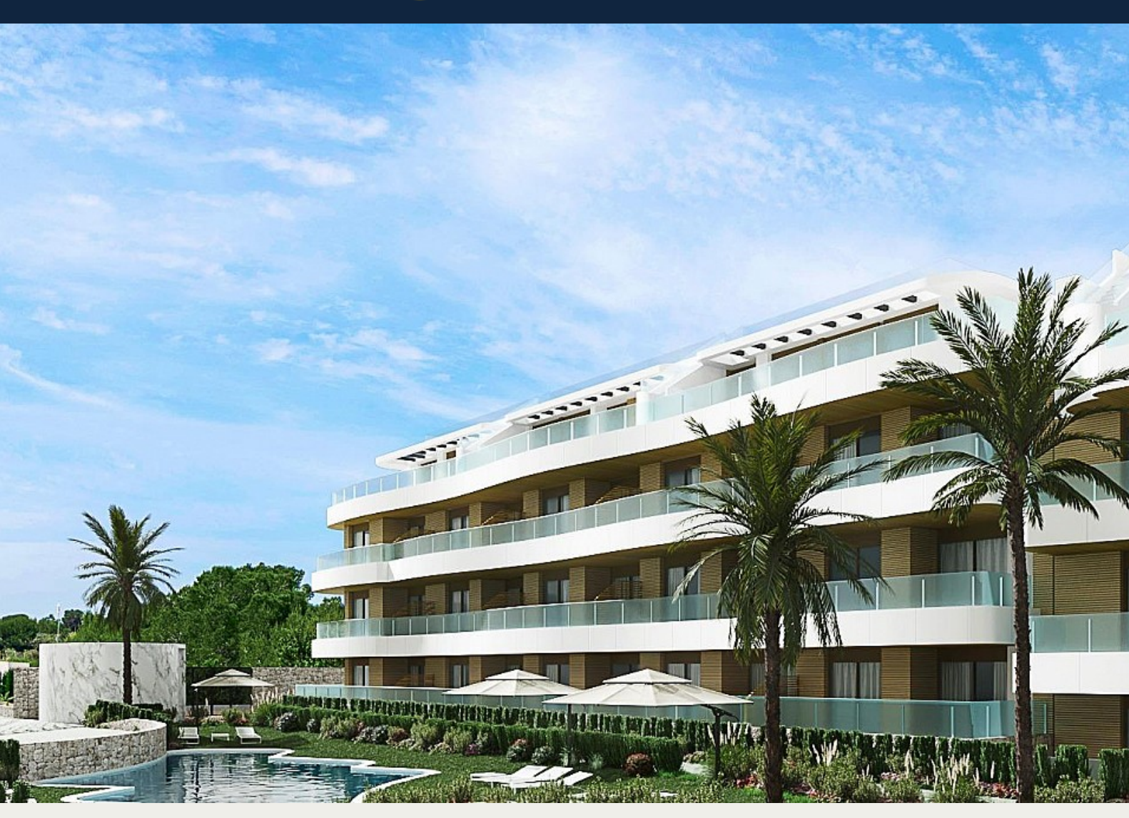
Penthouse in Orihuela Costa - New build