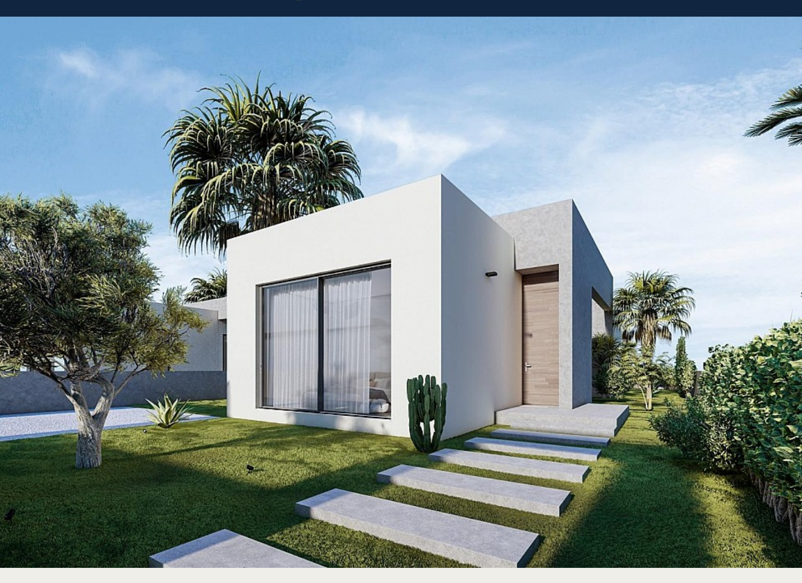
Detached Villa in Banos y Mendigo - New build